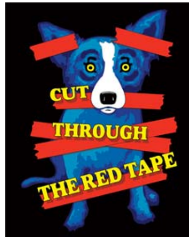
Cut Through the Red Tape 17 X 21