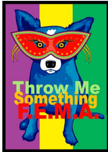
Throw Me Something FEMA 23 X 16