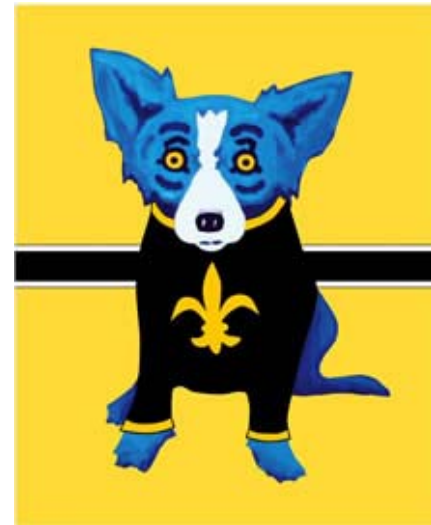
We Are Marching Again 23 X 18