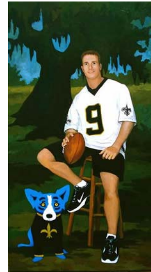
Drew Brees 32 X 19

The Relief series are silkscreen prints signed by George Rodrigue and offered to non-profits for $500. All prints are open editions, meaning they are not numbered, with the exception of You Can't Drown the Blues, which is a limited edition numbered to 500.