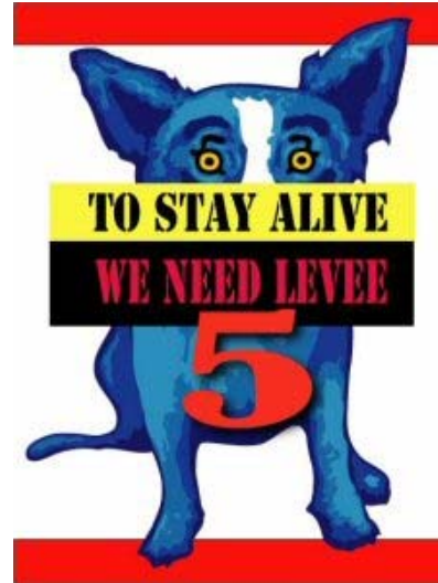
To Stay Alive We Need Levee 5 21 X 16