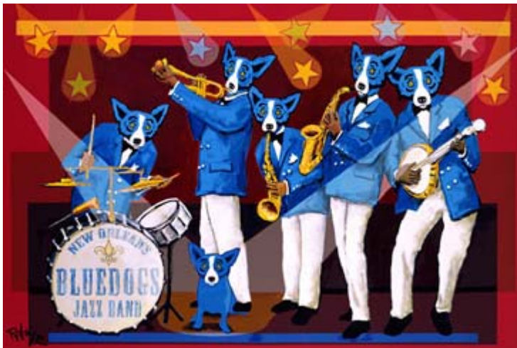
You Can't Drown the Blues 18 X 24