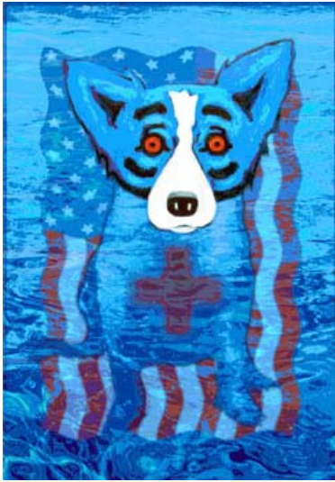
We Will Rise Again 23 X 16